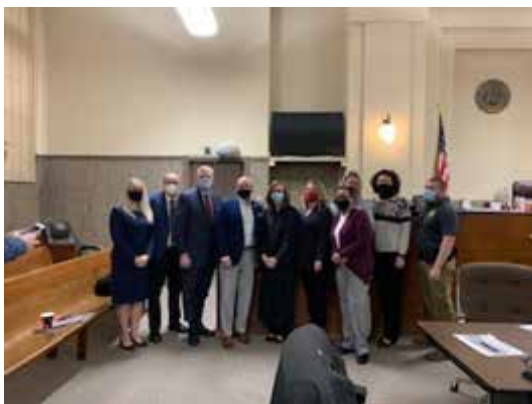
Pictured above, from left to right, is Chief Deputy Prosecuting Attorney/ Special Assistant United States