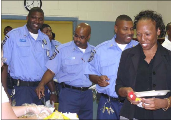
Left: Varner Unit staff members line up for the employee awards luncheon.

The luncheon was sponsored by the Varner Unit Employee Corporation.