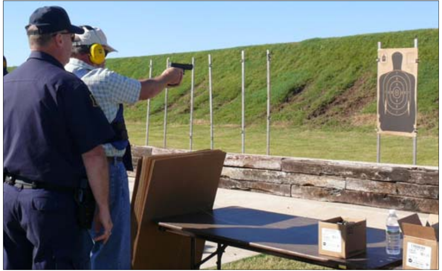
Above: Those who attended the recent opening of the State Police firing range on the grounds of the Wrightsville Complex got the opportunity to fire some weapons at targets.

The range opening/exhibition featured demonstrations, tours of ADC's Hawkins Center for Women, Boot Camp and Arkansas Correctional Industry furniture factory and printing operation as well as several State Police exhibits.