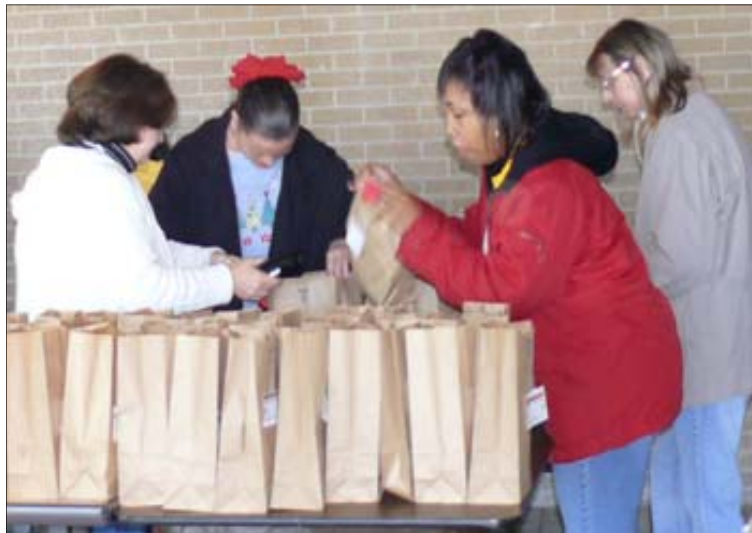
Administrative Services staff members pack hot dog and polish sausage sack lunches that were sold on Oct. 24 to benefit Santa Central.

"Once all applications have been received (deadline is Nov. 18) we will also have a Santa Central Wish List Tree located in room 706," Simmons said. Please stop by and select a name or family from the tree.