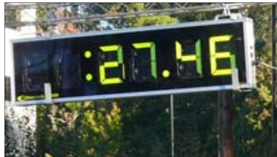
New this year: digital time read-out over the finish