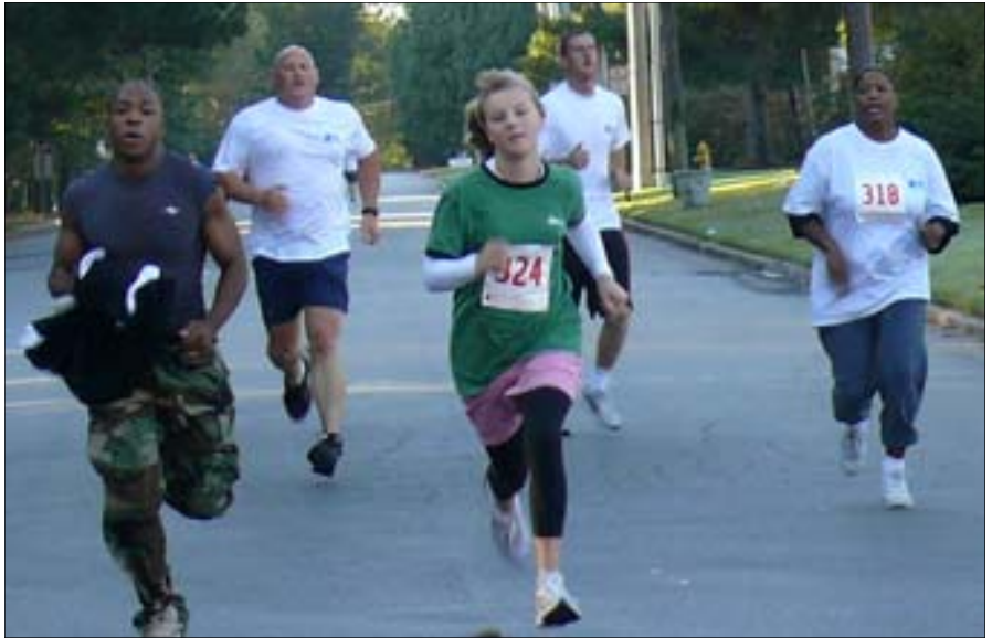
Above: Runners sprint towards the finish line during the Red Ribbon Run.

Thanks to everyone who took part and see you next year!