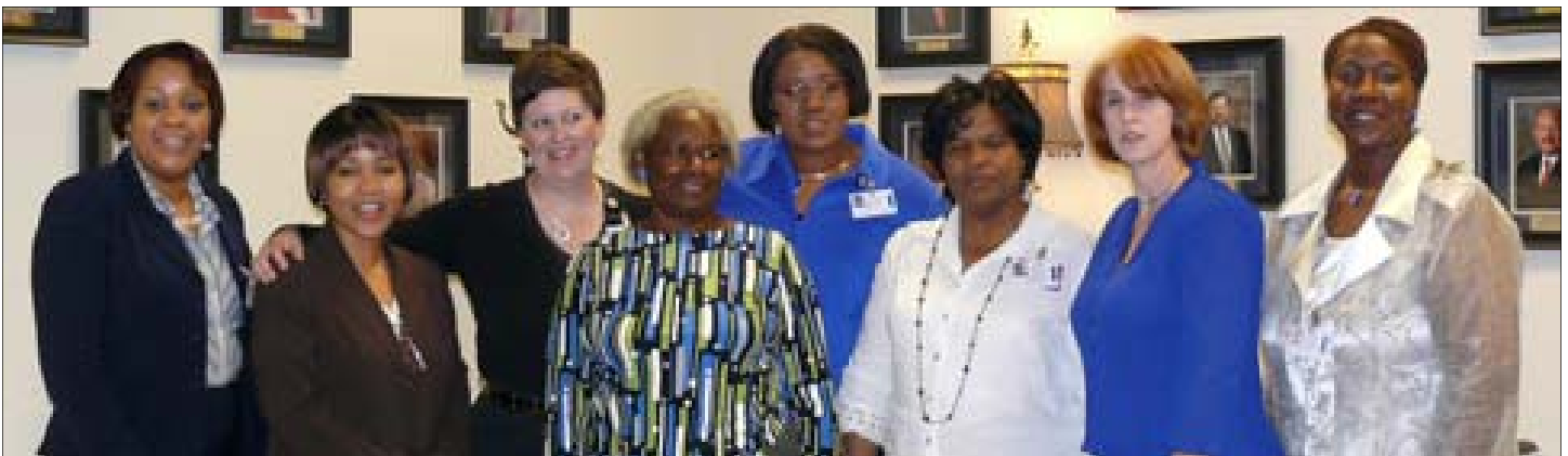
Above: Committee members worked hard to make the second annual Distinguished Gentlemen Seminar a success.