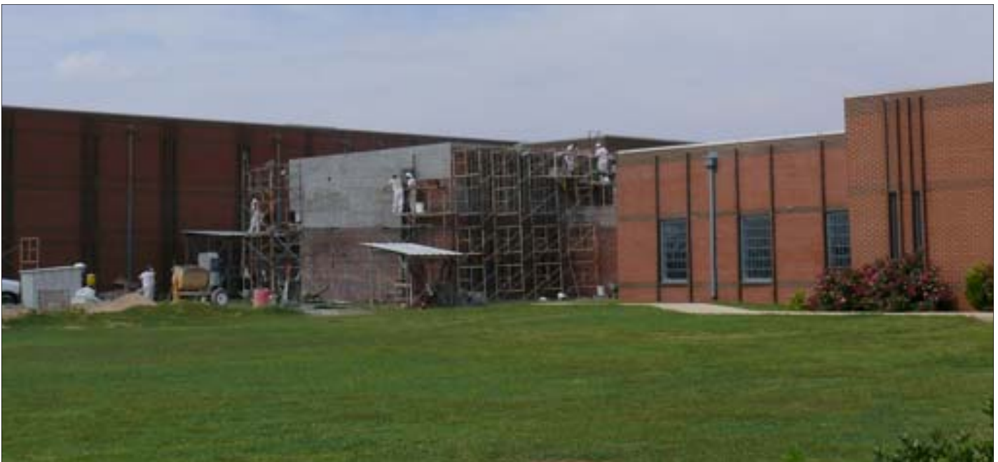
Above: The 2,400-square-foot chapel is taking shape at the Maximum Security Unit. The building will include two classrooms and a sanctuary with seating for about 50 people. Funds for the project are provided by local churches and organizations.