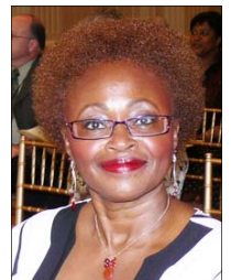
Joyce C. Brown Central Warehouse