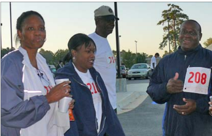
Above: Staff members from the Delta Regional Unit chat and enjoy refreshments before the race begins.