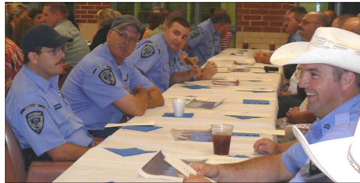
Left: Staff members from the Newport Complex gathered for the employee awards luncheon.