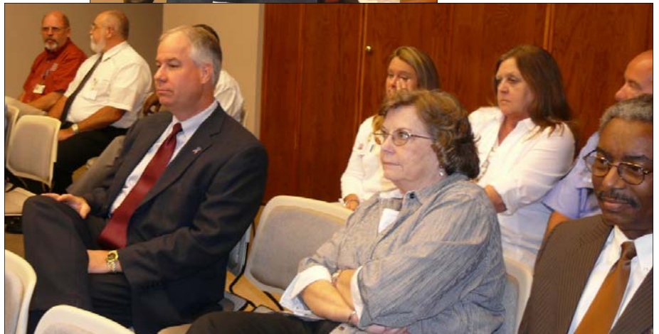
Right: Staff members from Central Office and Administrative Annex East gathered in the Director's Conference Room to hear the ACA audit results.