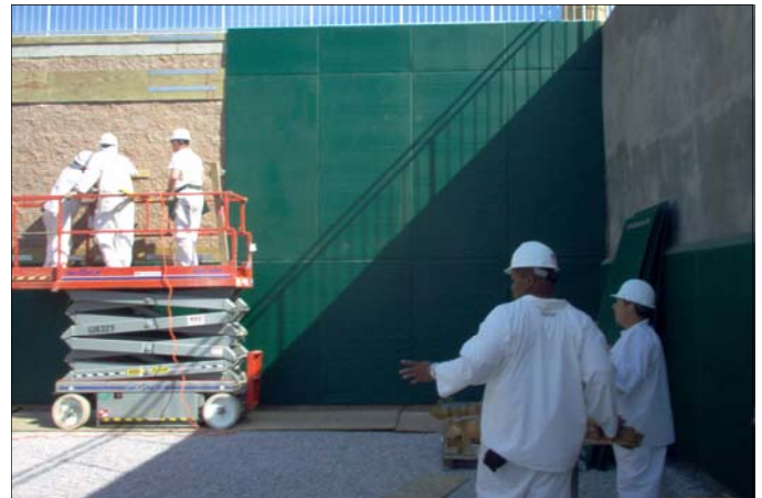
Above: Inmates install wall padding at the Northwest Arkansas Naturals League's baseball field in Springdale.

Several area athletic fields feature ACI wall padding, he said. They include Pine Bluff High School, Central Junior High and Mountainburg High School.