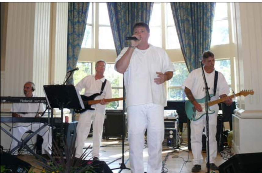
Above: The Cummins Prison Band performed during the 2008 Spirit of 110 Council volunteer recognition event held at the Governor's Mansion.