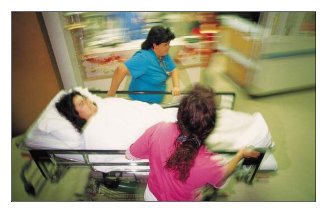
By donating to the catastrophic leave bank program, you may help someone through a difficult time.

be completed and dated no Humans Resource Manlater than Dec. 28, 2007, ager. Thank you in adand returned to your Unit vance.