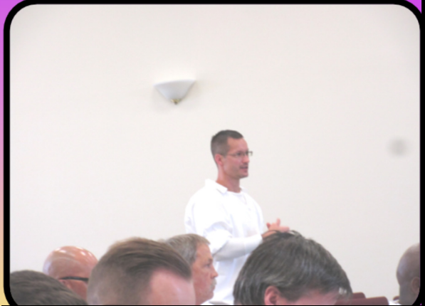
Representative of OCSE Speak to Think Legacy Participants

Summer visitation – Your court order may allow for an extended summer visitation. In some instances, the order may allow the support payments to be suspended or decreased during those visitation periods. Please carefully review your court order, since it will be necessary for you to notify OCSE so that you receive proper credit for that time period.