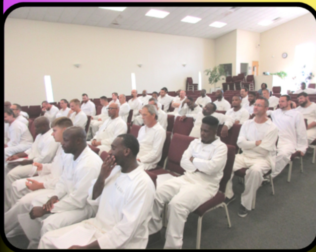
Think Legacy Participant listening to the presentation of OCSE

There are things that may occur that could increase, decrease, or stop your child support obligation, depending on what your court order says. Some examples are: