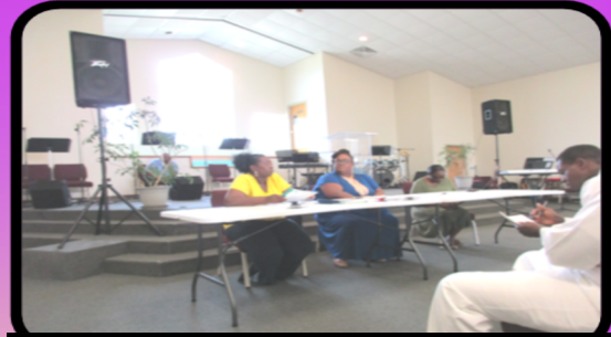
Representative of OCSE Speak to Think Legacy Participants