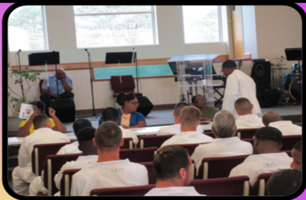
Think Legacy's participants taking notes during OCSE presentation