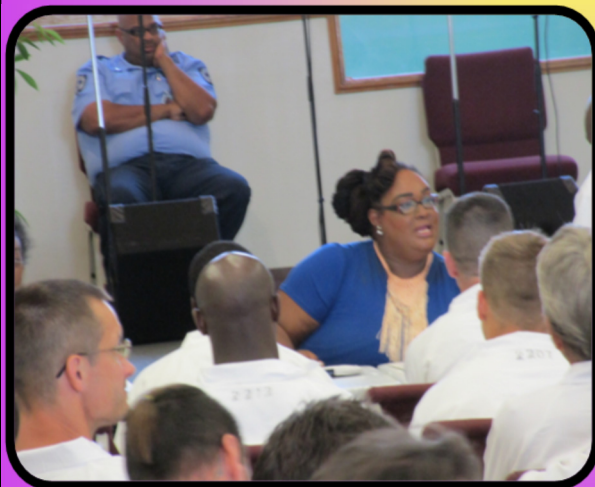
OCSE Representative speaking to participants of Think Legacy