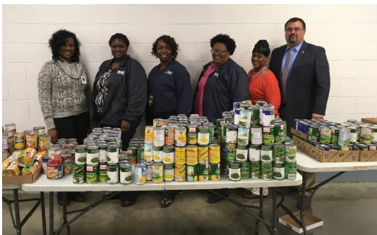
EARU staff collect an abundance of food for local needy families.

Between the dates of Nov. 1 and 14, EARU staff collected 1,231 can goods and non-perishable food items for needy families. They divided the items into 20 care packages. The Employees Association added a Turkey to each package and delivered the items to families on Nov. 17, 2016.