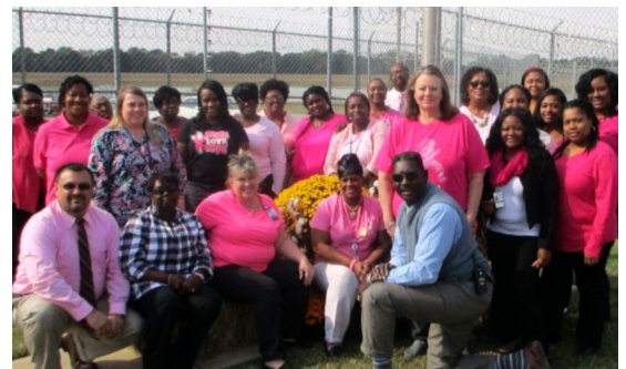
EARU staff wear pink on Oct. 26 in support of breast cancer awareness.