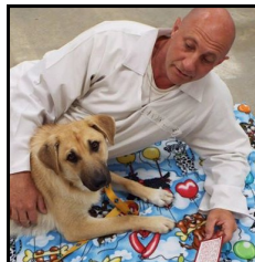
The first WIL blanket goes to PIP dog Seymour.

he wanted to move PIP to the top of their list as soon as they wrapped up the needs of the shelter they were currently helping.