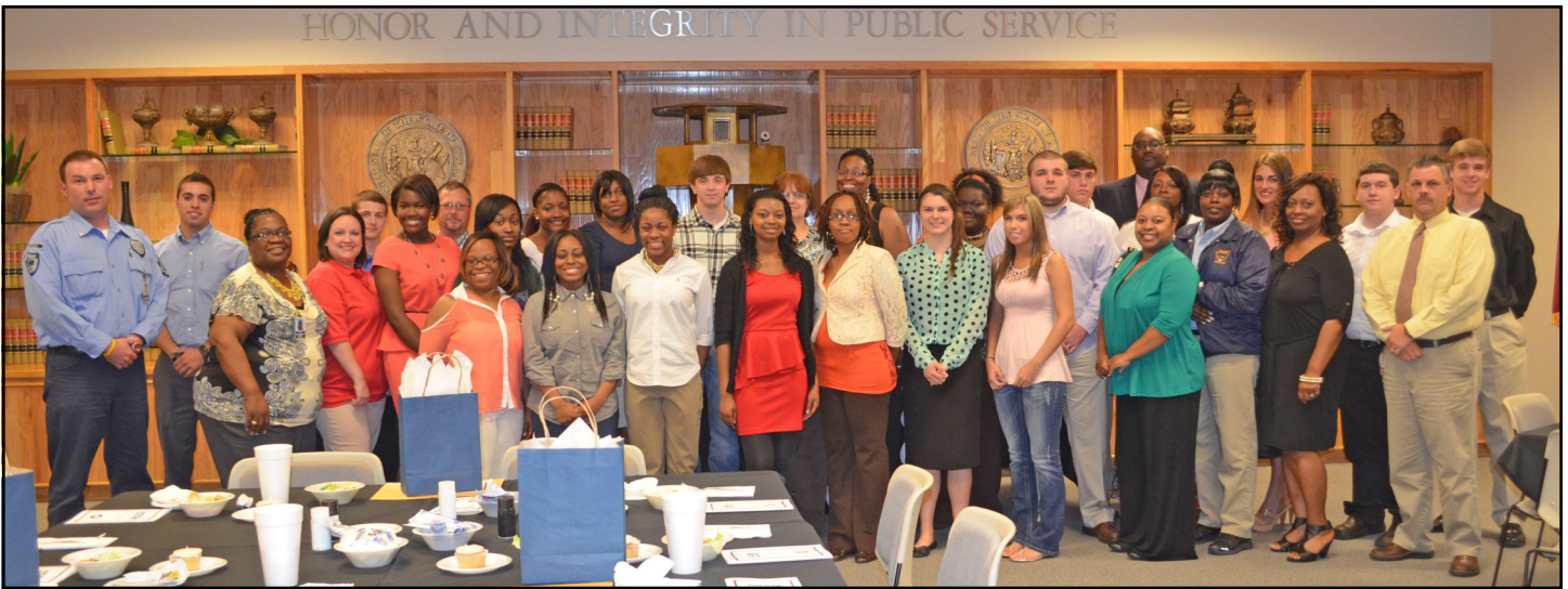
AACET Gold, Bronze and Silver awardees.