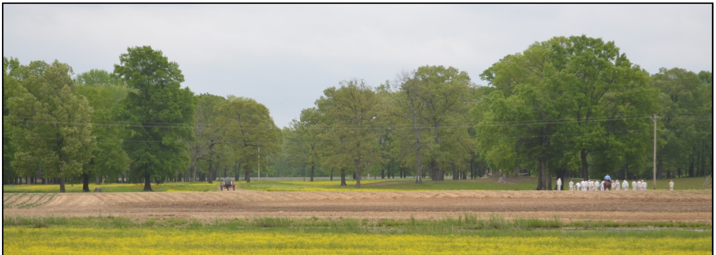
The corn is popping at Ouachita River Correctional Unit.