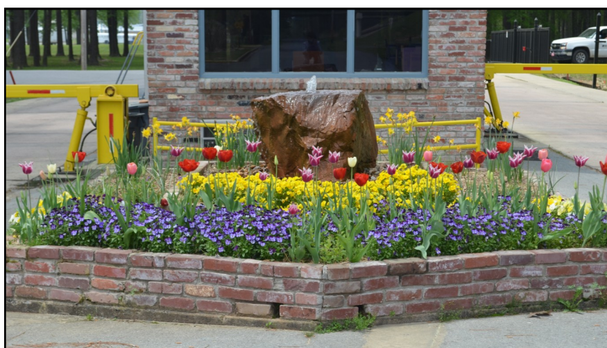
Entrance gate to the Pine Bluff Complex.