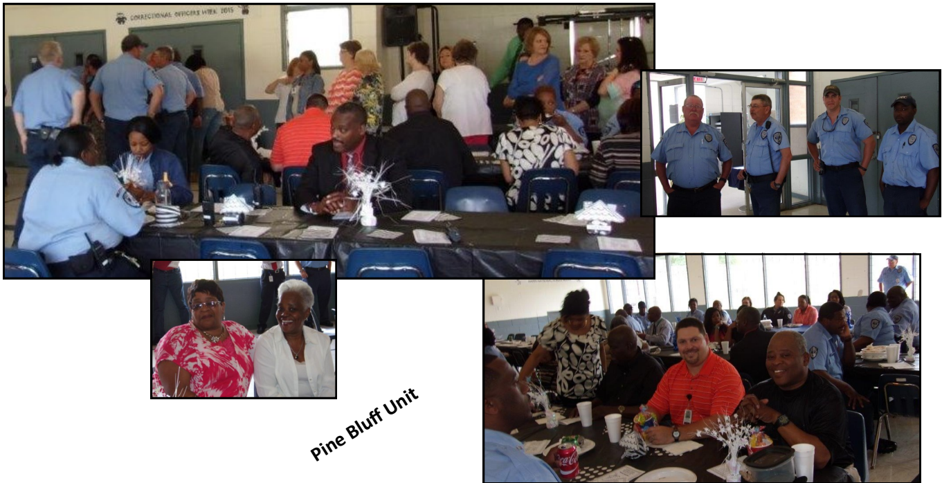
Pine Bluff Unit