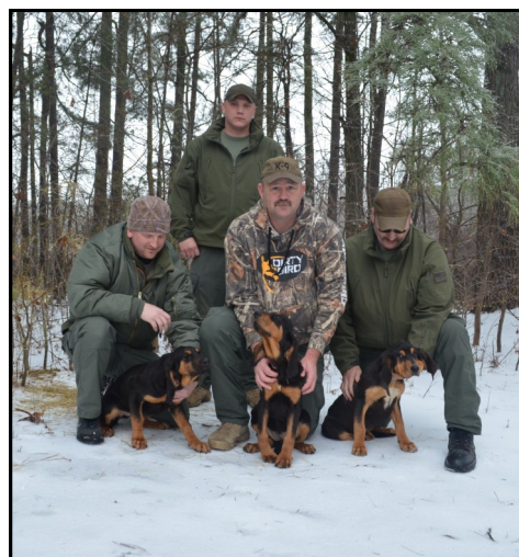
Central Office K9er's with 5-month-old black and tans Zoey, Ziva, and Zelda.