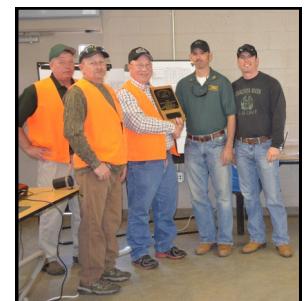
MULTI-LEASH DIVISION Winners: Tucker, Jackson Corrections Institute, ADC CO1, ORCU