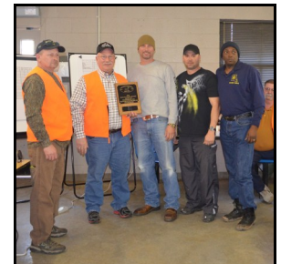
SINGLE DIVISION Winners: Tucker, Elayn Hunt Correctional, Rayburn CC, David Wade Correctional