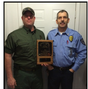
PACK DIVISION Winners: ORCU, Cummins, EARU, Tucker